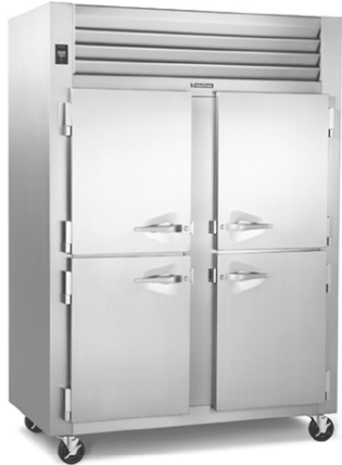
Model RLT232NUT-HHS (shown with standard left/right hinging and optional casters)