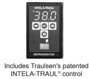
Includes Traulsen's patented INTELA-TRAUL® control