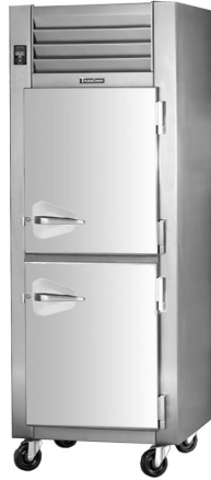
Model RHT126WPUT-HHS (shown with optional casters)