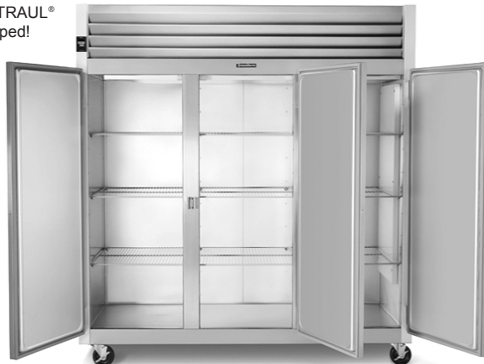
Model AHT332NUT-FHS (shown with optional casters)