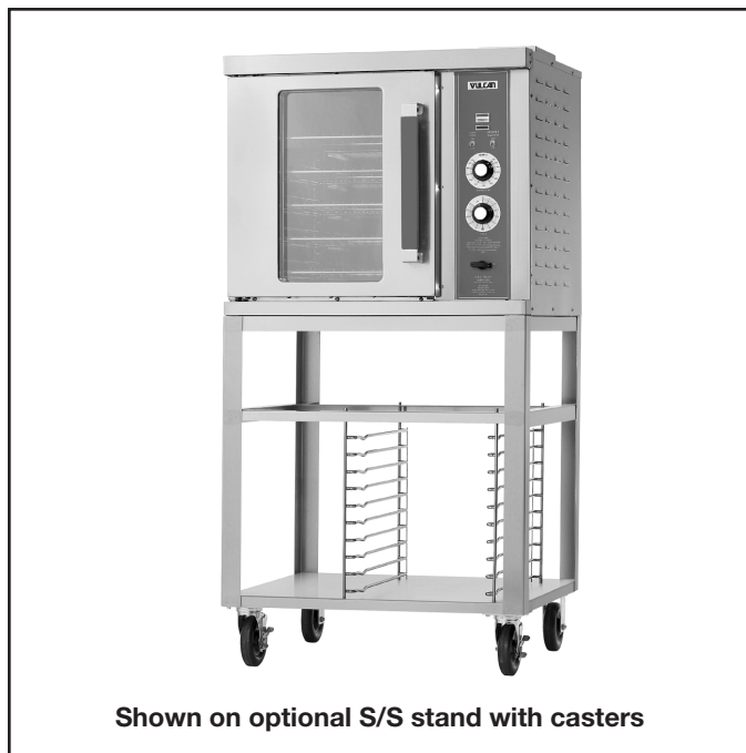
Shown on optional S/S stand with casters