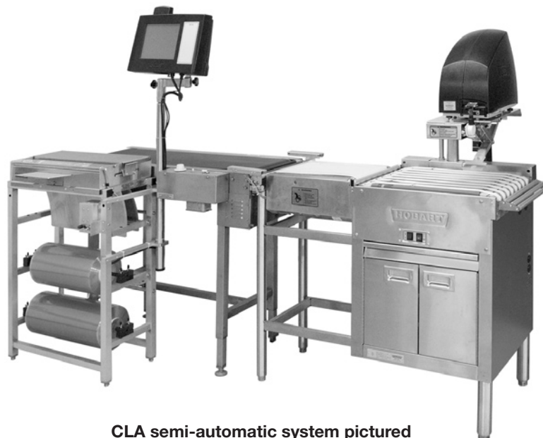
CLA semi-automatic system pictured with W32 wrap station, SP-5 sealer belt, CLA indexer, and Access scale and printer

Reference F-40256 for CLA components and accessories