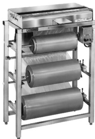
W3-2 Wrap Station

SHIPPING WEIGHTS: W32 – 50 lbs.; W32C – 60 lbs.; 55A – 10 lbs.; 69A – 5 lbs.