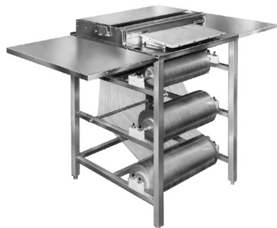
W3-2C Wrap Station with two optional 69A Platter Shelves