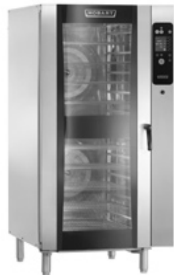
CE20HD shown without standard removable trolley insert