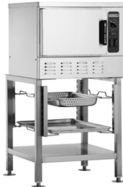
Shown on optional stand with extra set of pan slides and pans