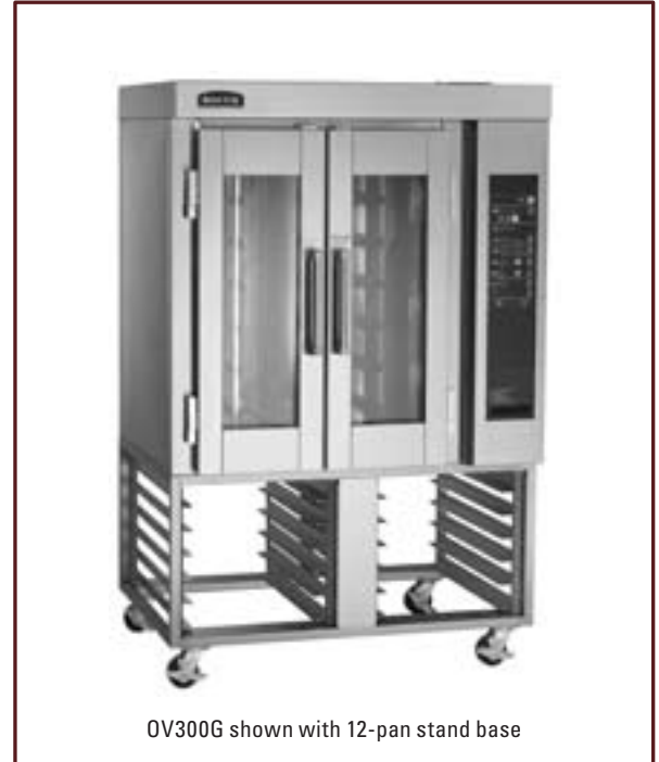
OV300G shown with 12-pan stand base

Note: Capacities based on a standard 18"x26" pan